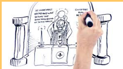
Sophia Sketchpad: The Eucharist

Walk Through the Mass: Exploring the Sacred Liturgy ( 22 minutes; Augustine Institute, 2014 ) This episode from the Symbolon series about the Catholic Faith includes a segment that examines the significance of the rites and rituals that make up each part of the Mass.